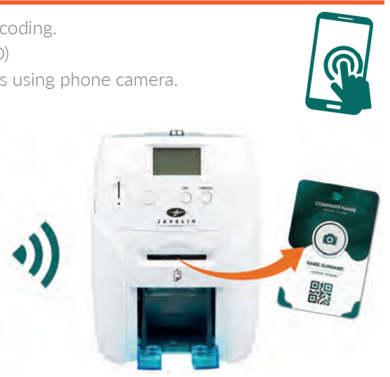
Tap the printer icon and your card will be printed wirelessly ready to issue.