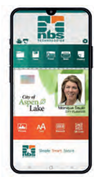
Mag encoding can then be added to the card design.