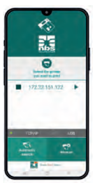
Open the App and select your DNA Printer using Wifi.