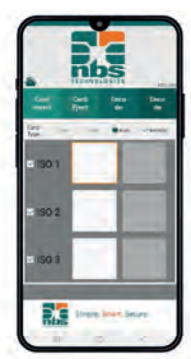
Images, Text and Barcodes can be added and sized.