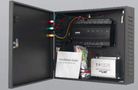
InBio-460 Package B

InBio series is an IP-based biometric access control controller with versatile and flexible functions and it is highly favored in the medium access control management projects with security requirements.