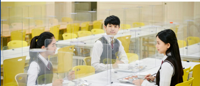
Large Scale Cafeteria