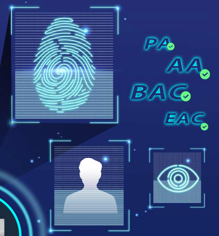
ICAO Doc 9303 standard

The ePassport provides security designs, which has personal biological characteristics such as fingerprint, facial recognition and pupils and greatly improves the anti-counterfeiting function of passport. The SecureScan X200 integrated RFID antenna design that is especially designed for ePassport detecting and reading information encoded on contactless integrated circuits in passports and ID cards. The RFID module is able to read RFID documents according to ISO 14443 (A/B), ISO 7816 (incl. US passport), ICAO 9303.