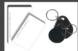
RFID Cards & Tags