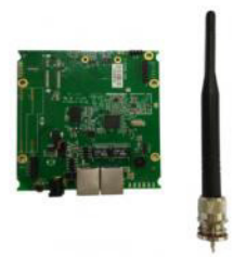
WiFi module with antenna